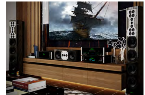
Bottom: MX100 AV Processor, MI347 7-Channel Amplifier, MVP901 Audio Video Player, XR100 Floor Standing Speakers, and LCR80 Center Channel Speaker in a home theater. All units sold separately.

Manufactured under license from Dolby Laboratories. Dolby, Dolby Atmos, Dolby Audio, Dolby Surround, Dolby Vision and the double-D symbol are trademarks of Dolby Laboratories.