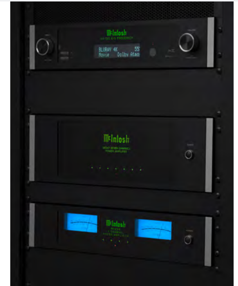
Top: MX100 A/V Processor, MI347 7-Channel Amplifier, and MI254 4-Channel Amplifier installed in AV rack.