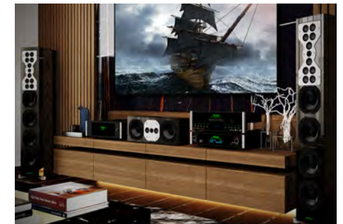
Bottom: MX100 A/V Processor, MI347 7-Channel Amplifier, MVP901 Audio Video Player, XR100 Floor Standing Speakers, and LCR80 Center Channel Speaker in a home theater. All units sold separately.